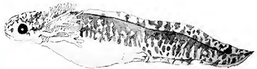
Fig. 4. Drawing of a formol-preserved larva of Tylototriton ziegleri at stage 35. Drawing C. Michel.

A comparison of water quality showed that T. ziegleri occurred in ponds with pH values between 6.4 and 8 (mean 7 \pm 0.5 ; throughout Cao Bang and Ha Giang provinces), while T. vietnamensis occurred in ponds with pH values ranging from 4.7 to 7.5 (mean 5.6 \pm 0.7 ; through-